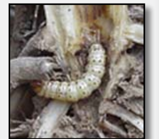
Southwestern Corn Borer Larva