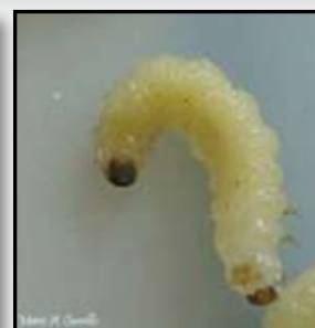
Corn Rootworm Larva