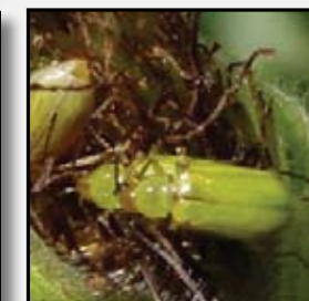
Adult Northern Corn Rootworm