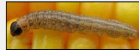
European Corn Borer 2 nd generation