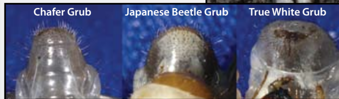
Chafer Grub Japanese Beetle Grub True White Grub