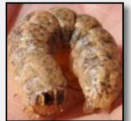
Western Bean Cutworm