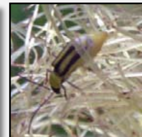
Adult Western Corn Rootworm