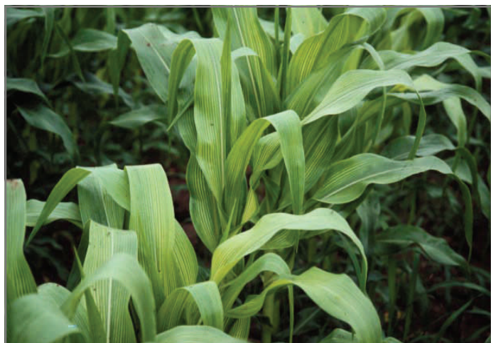
Figure 1. Corn showing sulfur deficiency symptoms.