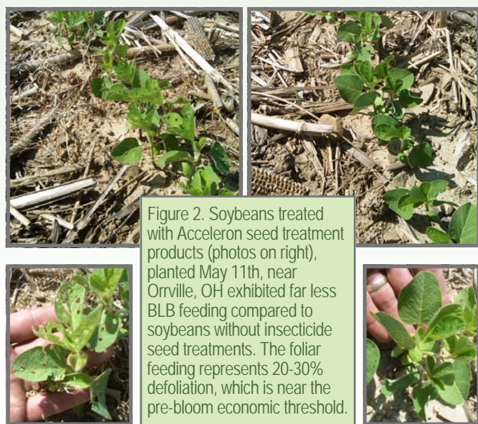
Figure 2. Soybeans treated with Acceleron seed treatment products (photos on right), planted May 11th, near Orrville, OH exhibited far less BLB feeding compared to soybeans without insecticide seed treatments. The foliar feeding represents 20-30% defoliation, which is near the pre-bloom economic threshold.

Individual results may vary, and performance may vary from location to location and from year to year. This result may not be an indicator of results you may obtain as local growing, soil and weather conditions may vary. Growers should evaluate data from multiple locations and years whenever possible. ALWAYS READ AND FOLLOW PESTICIDE LABEL DIRECTIONS. Acceleron ® and Technology Development by Monsanto and Design ® are registered trademarks of Monsanto Technology LLC. All other trademarks are the property of their respective owners. ©2011 Monsanto Company. 06.09.2011.EJP