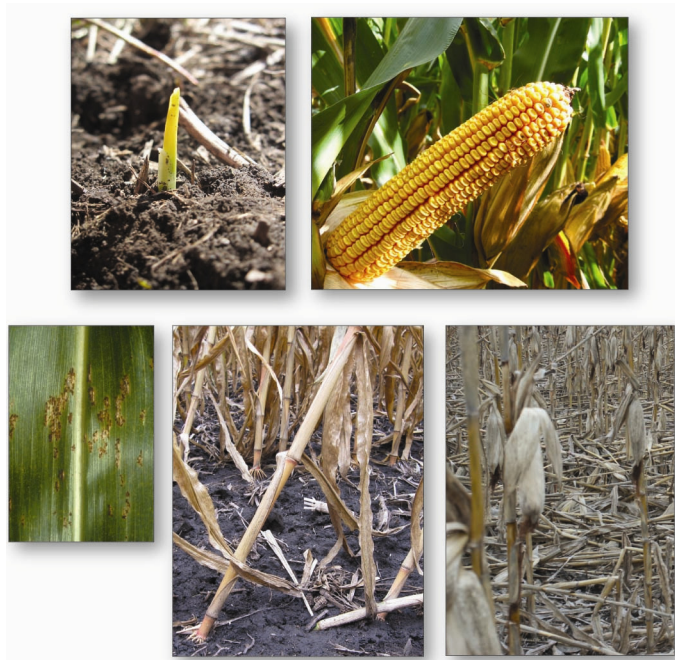
Figure 1. Emergence, vigor, disease tolerance, root and stalk strength are key hybrid characteristics to consider, in addition to yield potential.

It is important to evaluate hybrids for tolerance to diseases that are common in your geography. Keep in mind that fungicide applications may mitigate some of the negativity associated with a hybrid's susceptibility to fungal diseases such as gray leaf spot,