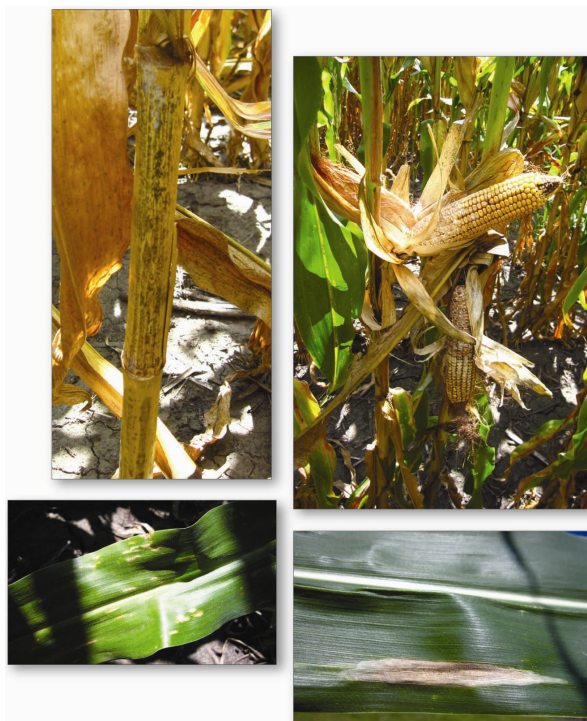
Figure 4. Rotating genetics can help decrease the potential damage from pathogens, such as anthracnose, diplodia, gray leaf spot, and northern corn leaf blight, that overwinter in corn residue.

When the environment is right for a disease to infect and develop on a susceptible hybrid, the inoculum load for that pathogen tends to increase. Many of these diseases overwinter in crop residue and are already present when second-year corn is planted (Figure 4). Overwintering diseases include anthracnose, diplodia ear rot and stalk rot, gray leaf spot, and northern corn leaf blight. If the same corn product is used in two consecutive years, there is a greater risk of disease having a negative effect on yield potential in the second year of production. To address this problem, carefully consider disease ratings and rotate to a different, unrelated hybrid each year.