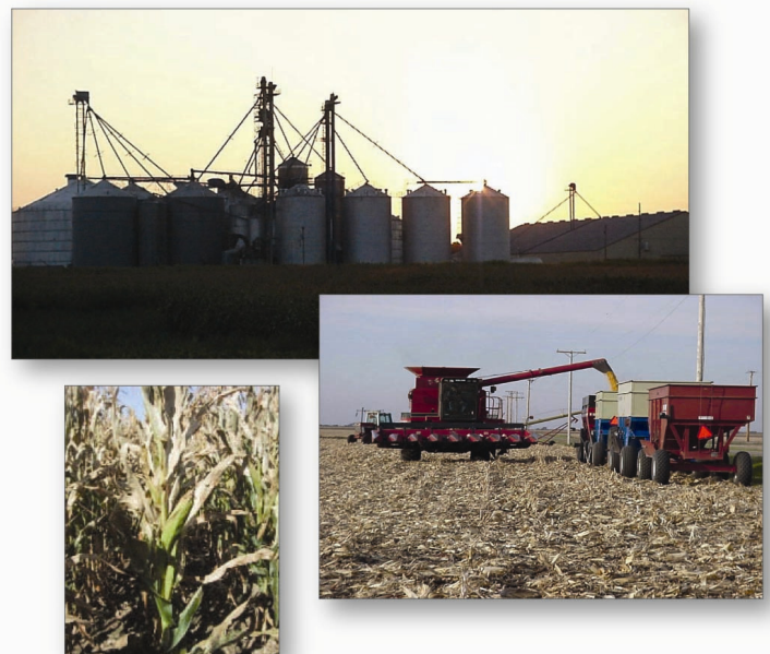
Figure 2. Having a package of hybrids with a spread of relative maturities can help manage harvest schedules and decrease the risk of damage from an early fall frost.

and northern corn leaf blight, among others.