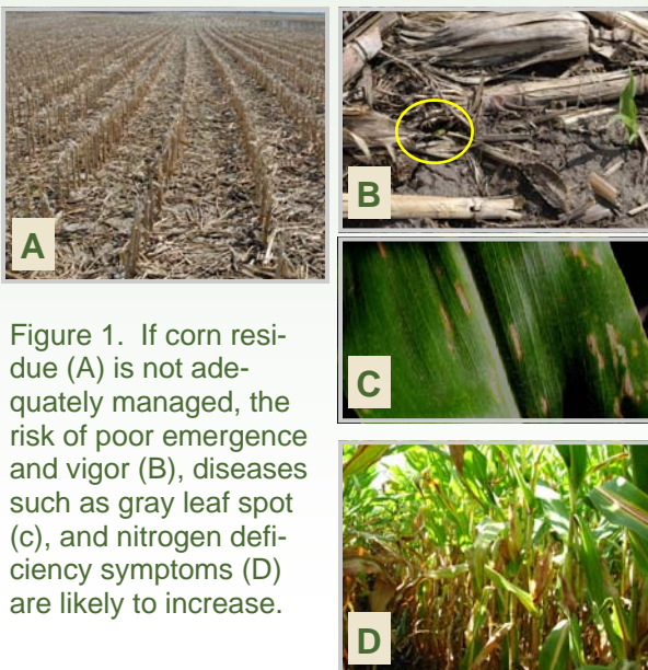
Figure 1. If corn residue (A) is not adequately managed, the risk of poor emergence and vigor (B), diseases such as gray leaf spot (c), and nitrogen deficiency symptoms (D) are likely to increase.

Mineralization is the release of N that generally happens upon the death of the soil microbes. The soil microbes feed on the carbon (C) in crop residues and require N to do so. Soil microbes generally try and maintain a carbon to nitrogen (C/N) ratio of approximately 10:1. C/N ratios of crop residues vary greatly. Alfalfa, soybean, and other legumes generally have lower C/N ratios near 15:1 and mineralization often occurs quickly. Crop residues that have higher carbon to nitrogen (C/N) ratios generally take more time to decay and result in higher