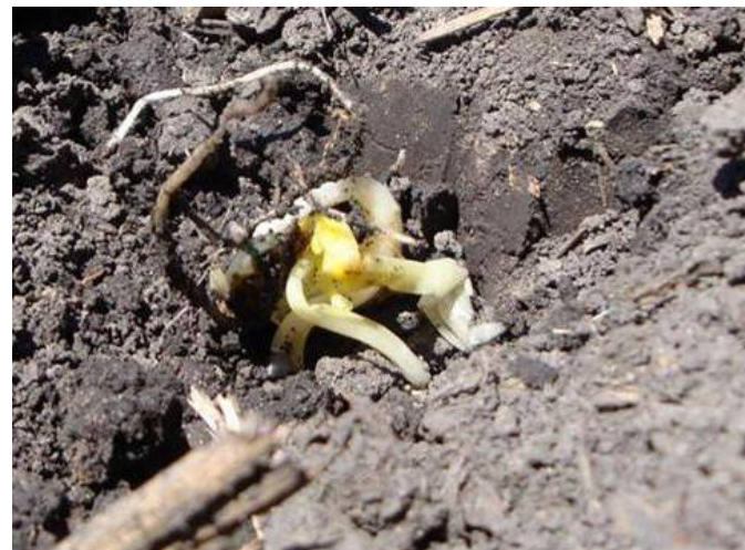
Figure 1. A corn seedling that suffered from chilling injury.

Symptoms of chilling injury can also be caused by other factors and may be compounded by additional stresses during germination. These stresses may include herbicide injury, disease, or soil crusting. Since